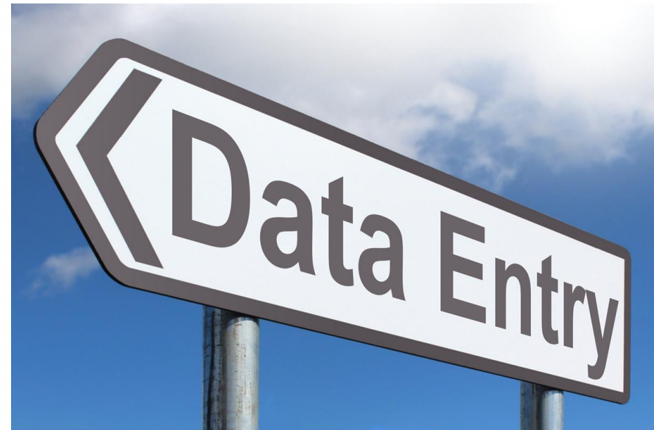
Data Entry by Nick Youngson CC BY-SA 3.0 Alpha Stock Images